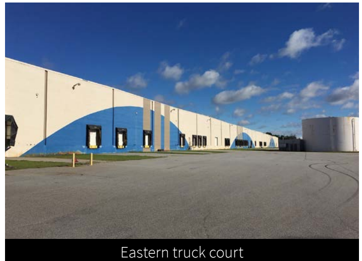
Eastern truck court