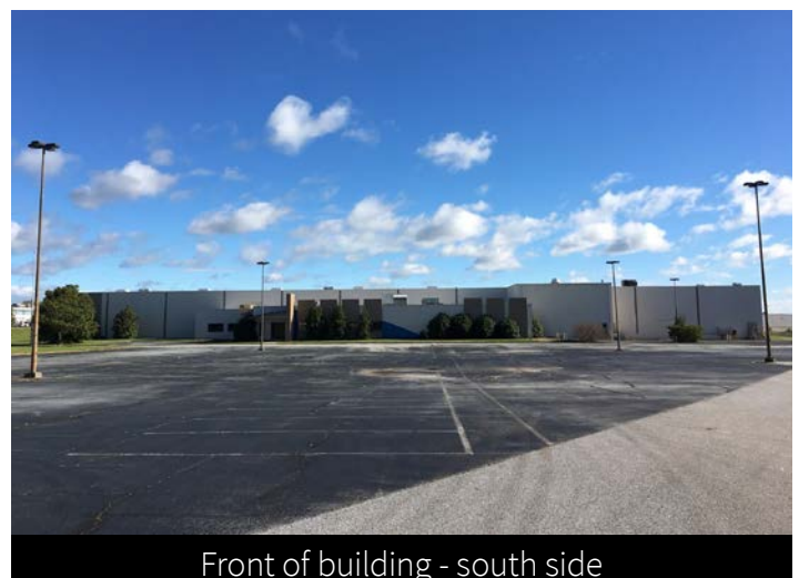
Front of building - south side