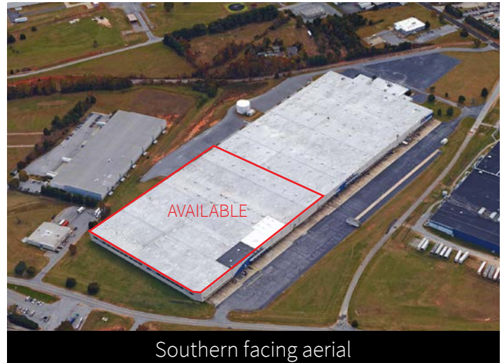
Southern facing aerial